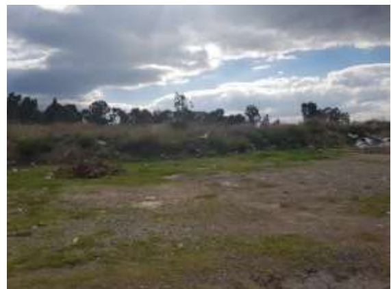
View of the land plot