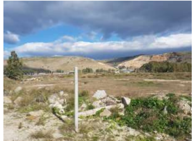
View of the land plot