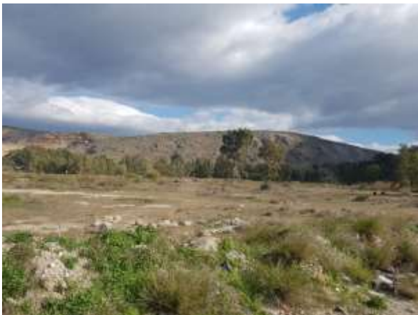
View of the land plot