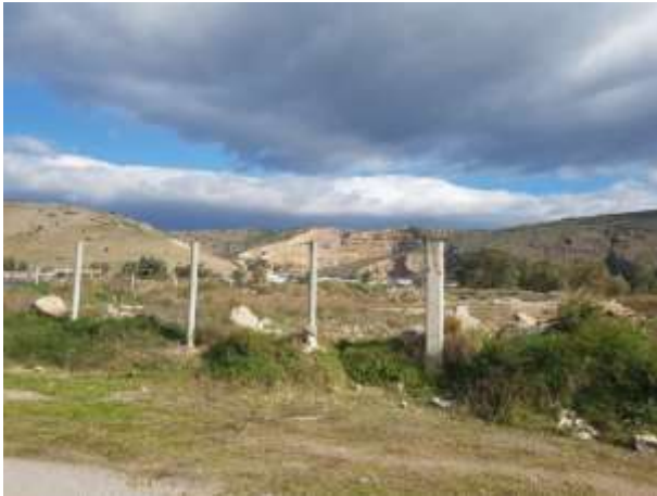
View of the land plot

A land plot at the area of “Nea Lampsakos”, Municipality of Chalkida, Regional District of Evia, Region of Central Greece.