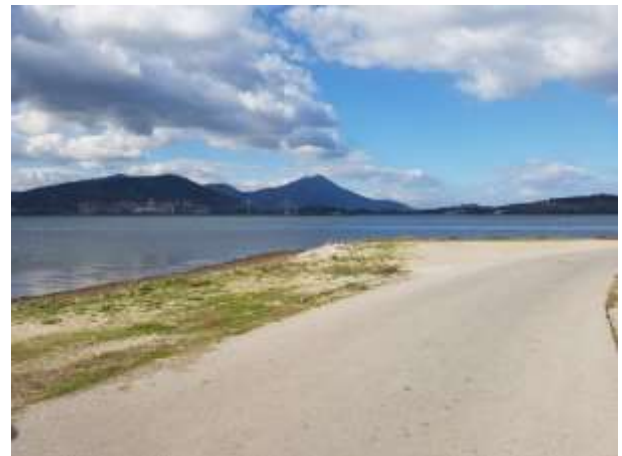
View of the land plot