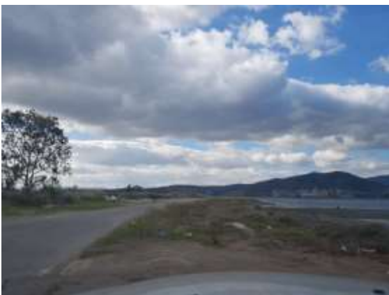
View of the land plot

Photographs of the premises taken on the date of our inspection are provided below.